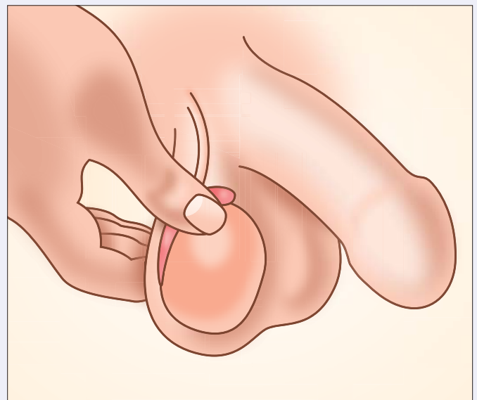
Fig. 2 Be aware of the epididymis, the long, narrow tube, behind each testicle that matures and stores sperm